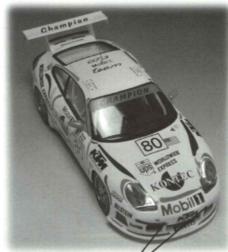
Add these decals from plans at right

the 996. Is the 996 GT-3R the acorn of mighty oaks to come?